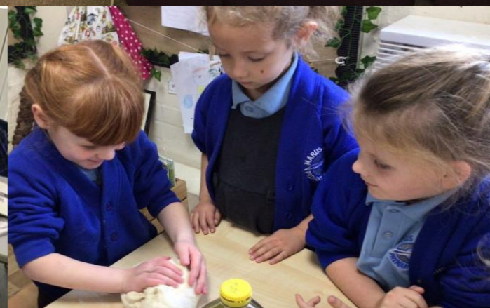
#Discovering healthy alternatives