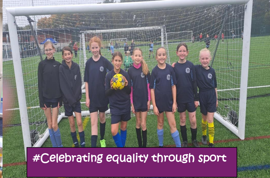
#Celebrating equality through sport