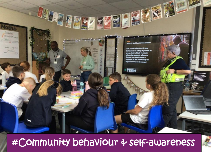
#Community behaviour & self-awareness