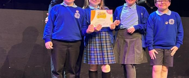
#Celebrating healthy success