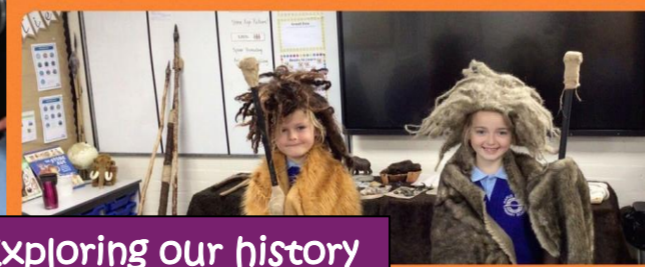
#Exploring our history