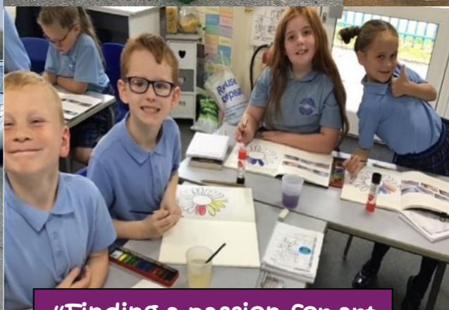
#Finding a passion for art