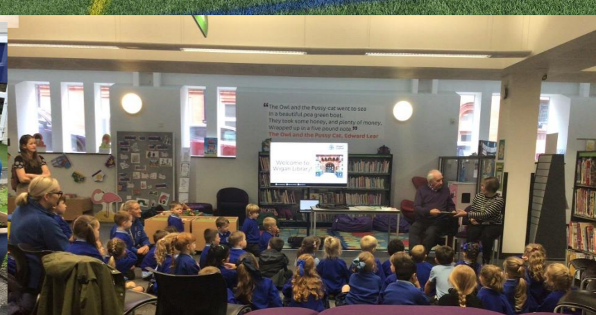
#Accessing our local facilities