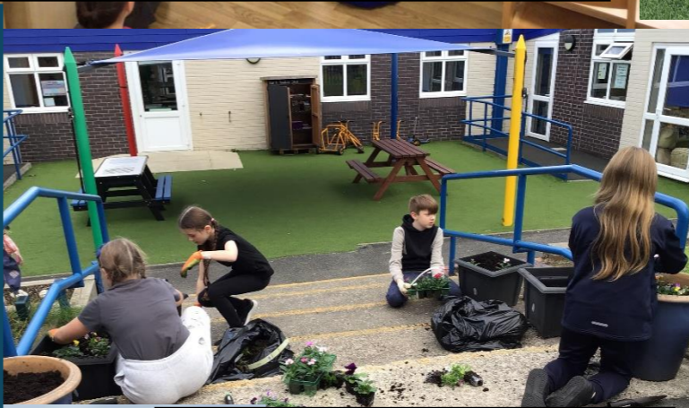
#Caring for our environment