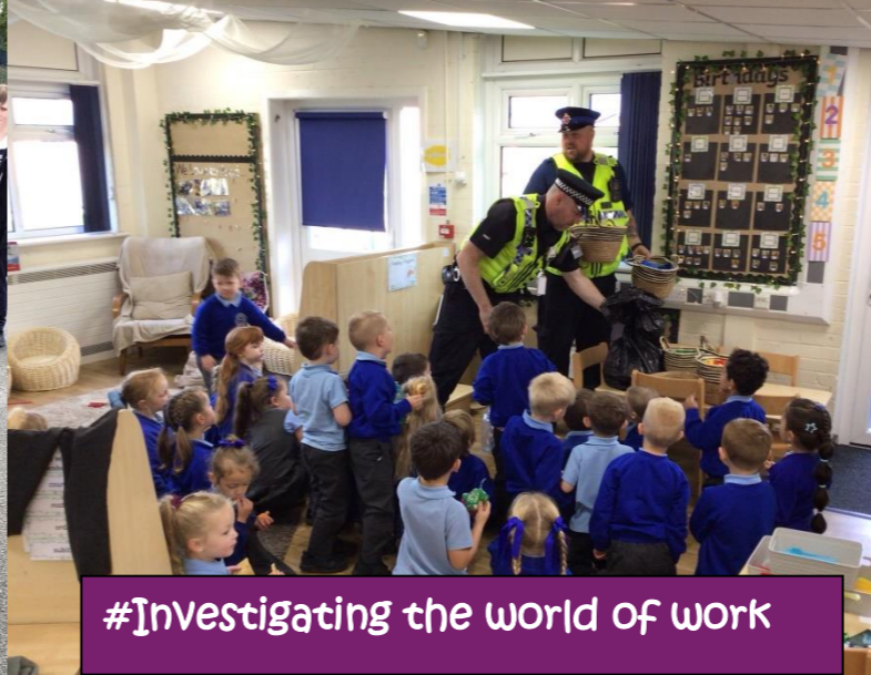
#Investigating the world of work