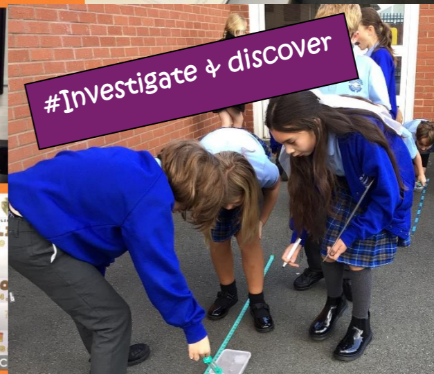
#Investigate & discover