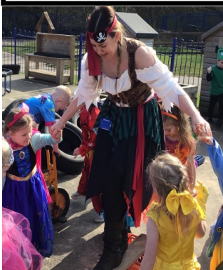
Pirates Love Underpants