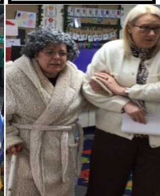
Granny from Jack & the Flum Flum Tree